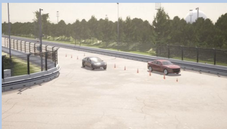
Figure 4: Representation of the outdoor facility of CARISSMA in the simulation environment CARLA.

The industrial project partner in this subproject is Audi AG.