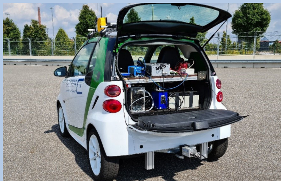
Figure 2: Test vehicle equipped with an ADMA G-Pro+, a Correvit S-Motion and a Car-PC.