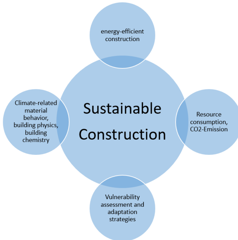
Figure 1.: Sectors of sustainable building

The bachelor's degree program in Sustainable Civil Engineering is designed to address and address this problem. Among other things, the course includes resource-saving construction and building in the life cycle. This means that climate-friendly planning and construction, which covers everything from use to dismantling of the structure. Other sectors that play a role in the construction industry are shown in Figure 1.